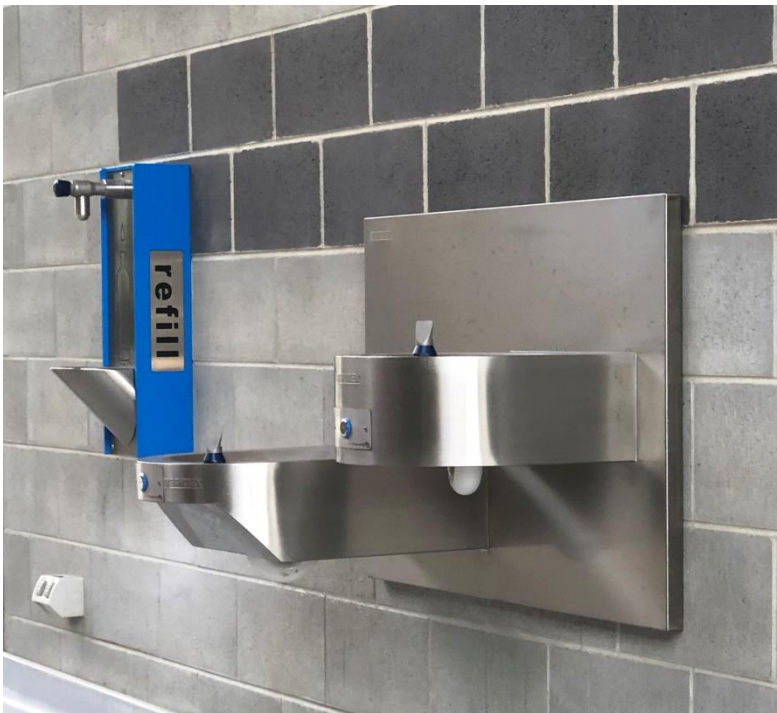
Photo: Lead Safe drinking bubblers by Galvin Engineering, at Perth Optus Stadium.

Health experts agree that any form of lead ingestion should be reduced or eliminated. As this study confirms lead exposure in drinking water is preventable, and drinking water supplied via GalvinClear® Lead Safe™ bubblers contains no detectable levels of lead. Indeed, all of our drinking bubbler models significantly exceed the requirements set by the WHO and the ADWG.