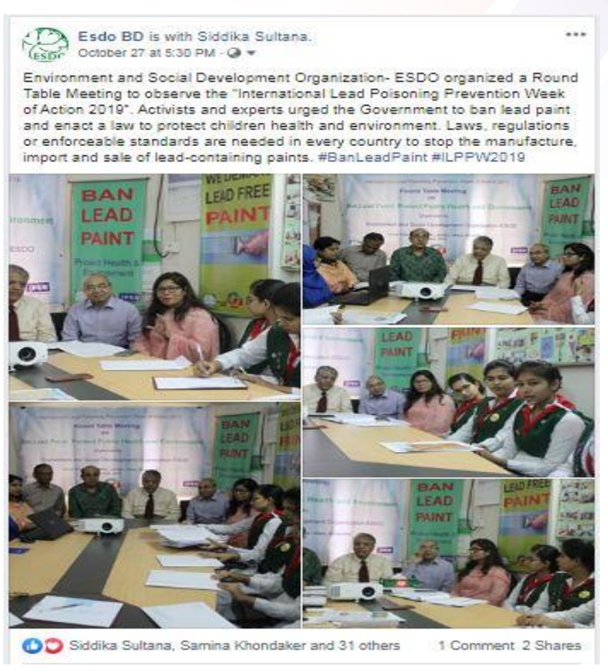
Fig: Facebook post from ESDO facebook page during round table meeting.

ESDO continued social media campaign round the week of ILPPW 2019 that is from 20 to 27 October 2019. Different messages regarding the danger of lead poisoning were posted in ESDO Facebook page and the updates of the events organized in Bangladesh by ESDO were also circulated in Facebook and twitter. Some screen shots are attached in the Annex-5.