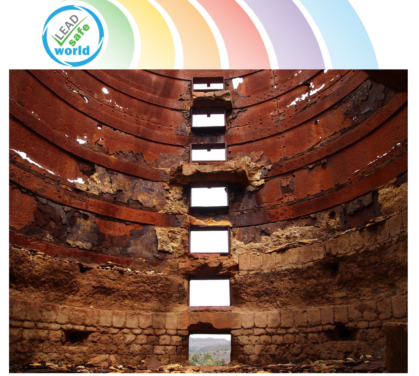
'Interior of Roaster'. Artist: Isla MacGregor