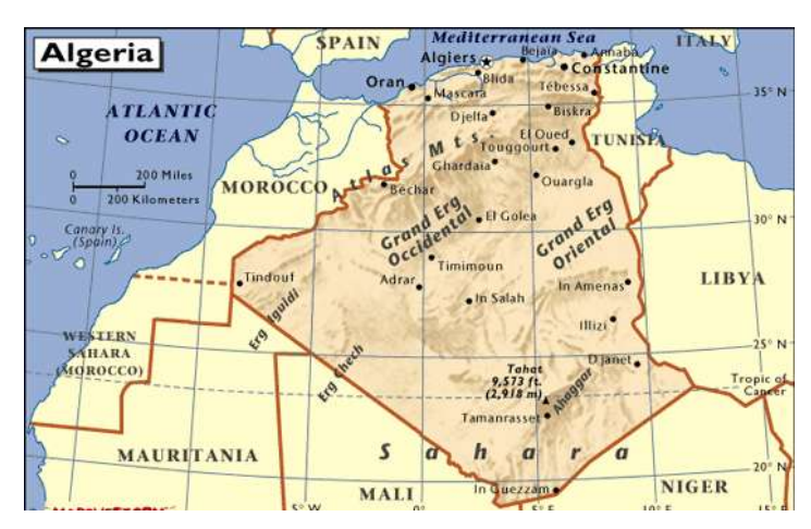
Algeria: Highest per capita GDP of leaded petrol countries for which 2010 data was available on IMF index

Cooper: (2010 data) 'It can be concluded with confidence that there is no causative relationship between per capita GDP levels and the elimination of lead additives from vehicular fuels, and that the per capita GDP values present in countries still reliant on leaded fuels today is not acting as a barrier to the global effort to eliminate lead additives from vehicular fuels.'