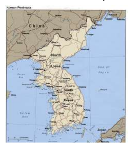
Korean Peninsula. North Korea was least-worst on the Press Freedom Index

'...it can be confidently asserted that the likelihood that a country is leaded is related to its level of democracy, and that the relationship between democracy levels and the elimination of leaded petrol operated throughout the period 2006 to 2010. It is clear that leaded countries are substantially less likely to be democratic than unleaded countries, and that as time has progressed this trend has become even more pronounced.