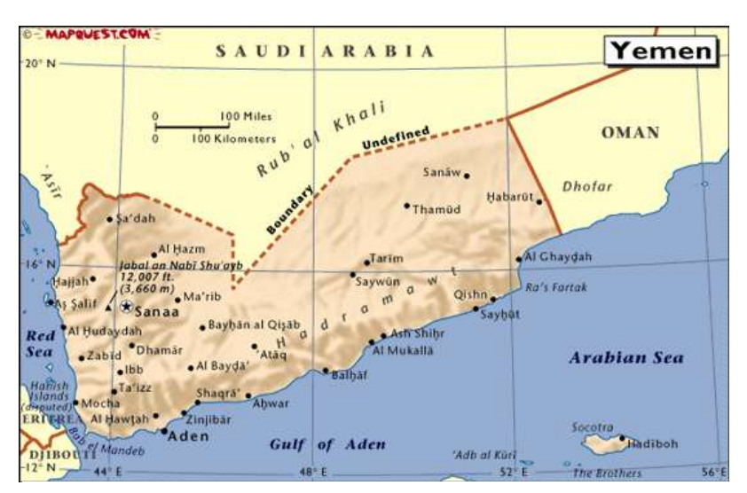
Yemen – highest ranked for economic freedom of the 4 out of 6 leaded petrol countries for which data was available in 2010

The ranking, out of 179 countries was as follows: Yemen, least worst of the leaded group (127), Algeria (132) Burma 174 and North Korea last at 179. Data for Afghanistan and Iraq was not available. Please note that these numbers do not represent the 'score' given by The Heritage Foundation and The Wall Street Journal, but how the countries rate in relation to each other.