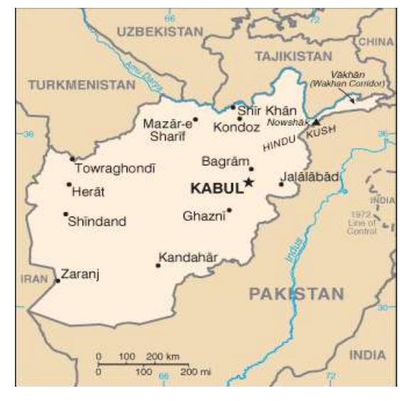
Afghanistan: Lowest per capita GDP of leaded petrol countries on IMF 2010 index

Cooper: (2010 data) 'It can be concluded with confidence that there is no causative relationship between per capita GDP levels and the elimination of lead additives from vehicular fuels, and that the per capita GDP values present in countries still reliant on leaded fuels today is not acting as a barrier to the global effort to eliminate lead additives from vehicular fuels.'